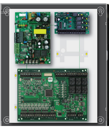
• EP1502 with lock control

304 Terrace Drive Mundelein, IL 60060 USA